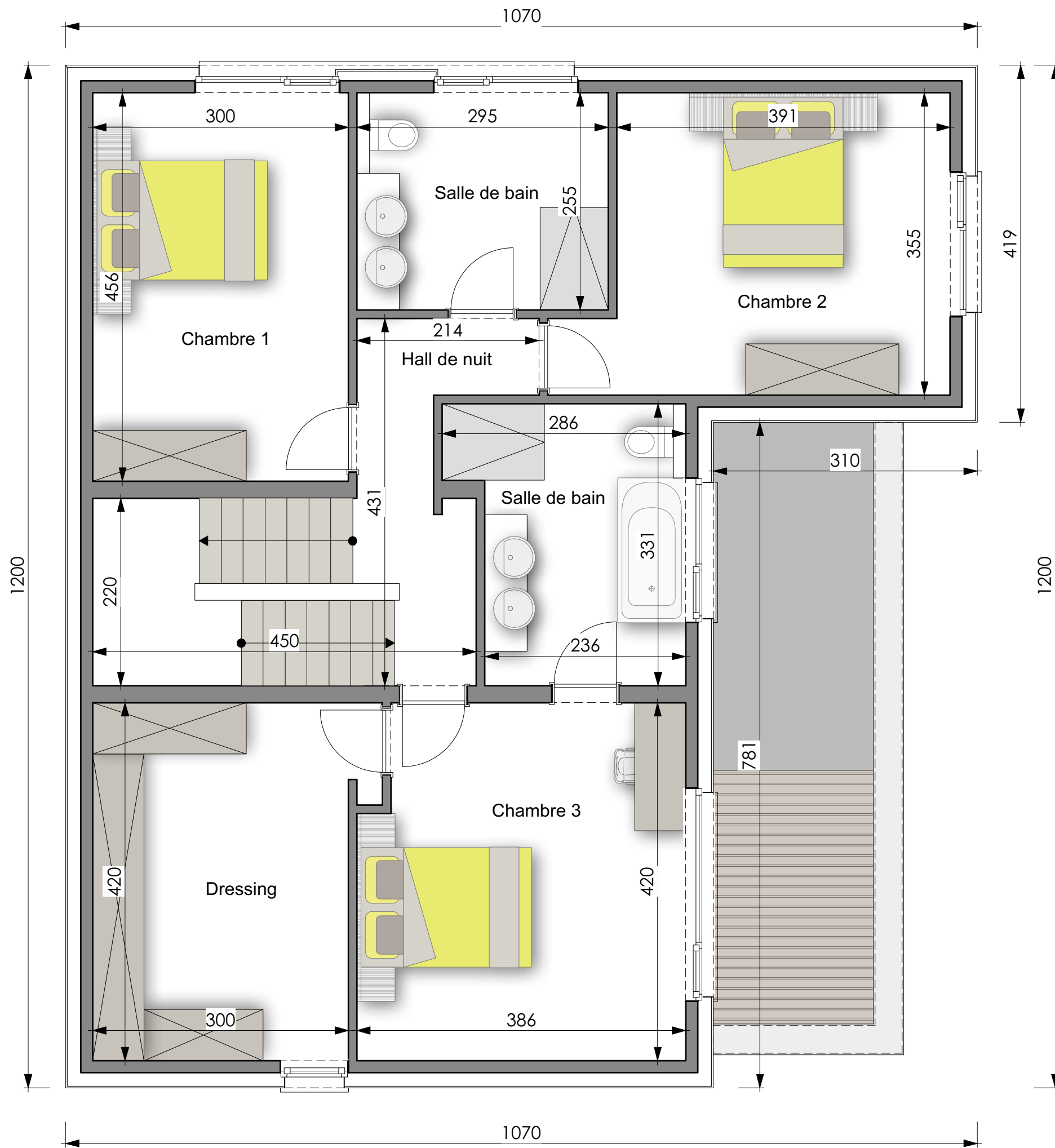
PLAN PREMIER ETAGE