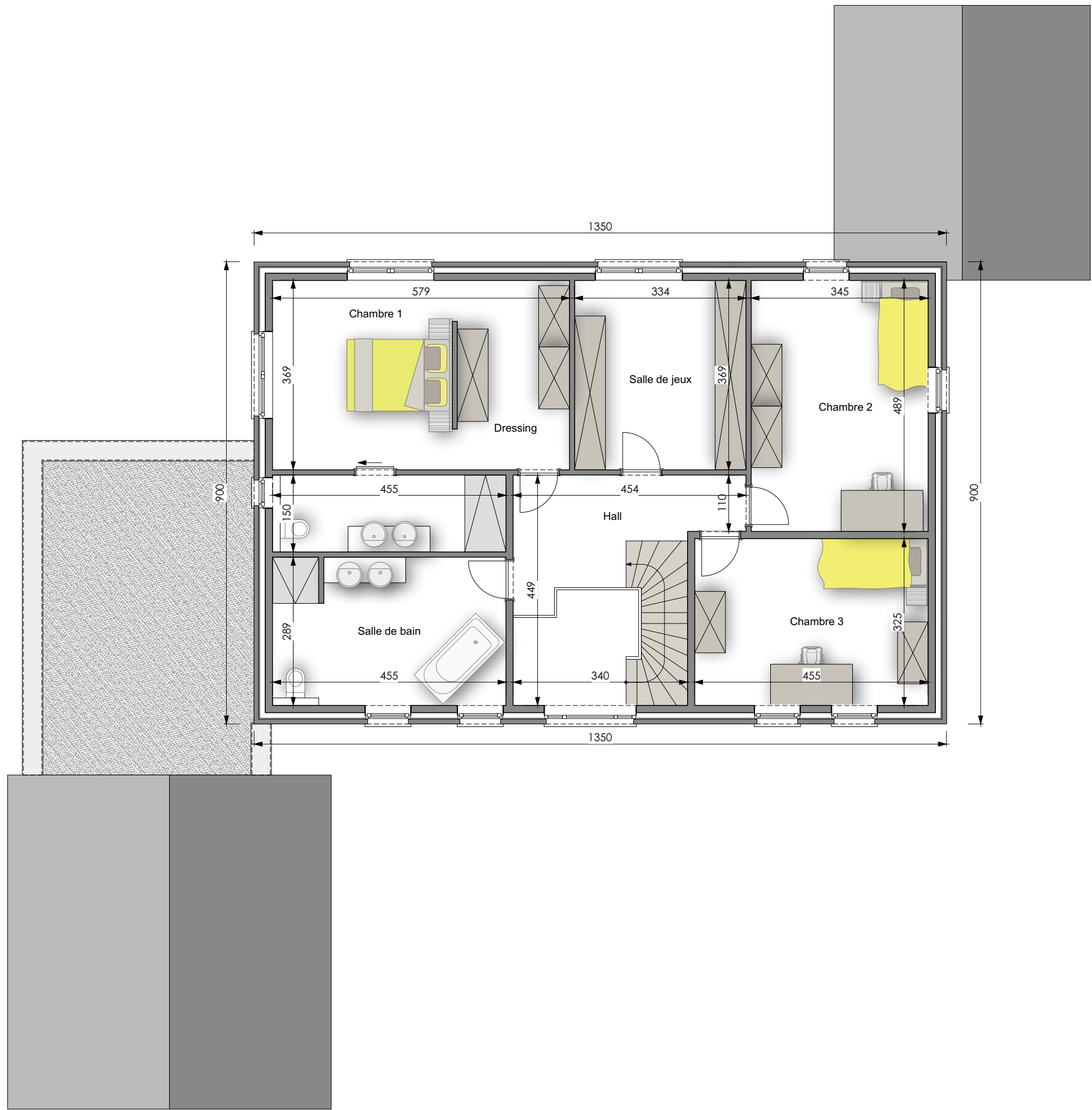
PLAN PREMIER ETAGE 0 1m 2m